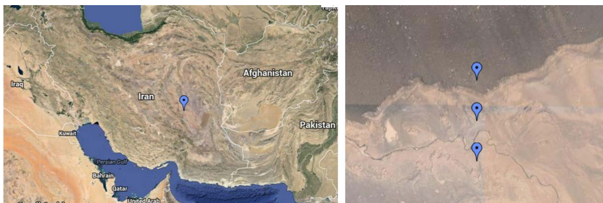
Fig. 1. Sampling locations of the Gandom Beryan region in the Lut Desert. The exact longitude of the area was 57.67 E and the latitudes were 31.02 N (1), 31.01 N (2) and 31.00 N (3).

Enumeration of the fungi and bacteria. After properly mixing the soil sample, a 1:1 (W/W) suspension in sterile saline solution was prepared (1/2 dilution). The suspension was shaken for 10 min at 37°C. In order to make 1/20 dilution, 1 ml of the soil suspension was added to 9 ml sterile saline solution. For an enumeration of fungi and bacteria 0.1 ml of the 1/2 and 1/20 dilutions were spread over the surfaces of potato dextrose agar (Merck, Germany) containing 200 µg/ml chloramphenicol and nutrient agar (Merck, Germany) containing 40 µg/ml acriflavin