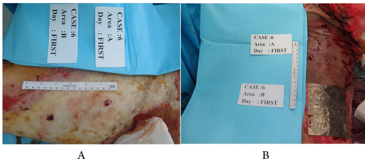
Fig. 1. A case of full thickness burn wound which is divided in two parts randomly

The frequency distribution of burn cause is shown by age and gender in Table 2. According to the results, fire, with the frequency of 9 of 18 (50%) was the most common cause of burns in men and flame and boiling water, with the frequency of 4 for each, were (33,3%) the most common among women. According to exact Fisher test, there was no significant