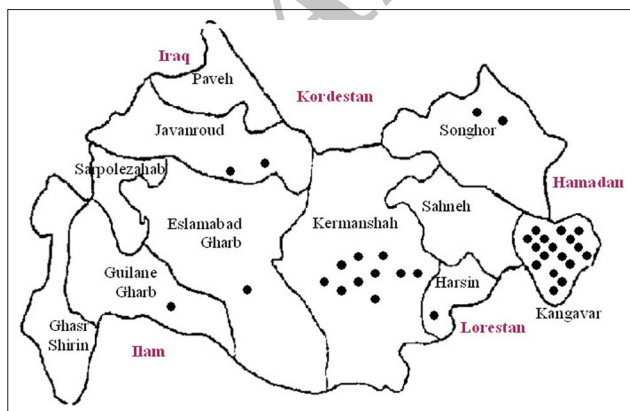
Figure 1: Distribution of human fascioliasis in Kangavar ( N=17 ) and other areas of Kermanshah province ( N=17 ), Iran, Spring 1999

The serum samples which were sent to Pasteur Institute and of Health at Tehran University approved the existence of anti- Fasciola hepatica antibodies by means of IFA, ELISA, and CCIE tests. It's worth noticing that diagnosis of the disease in this stage is only possible through serological tests. In other words, the serological tests are useful during acute infection because symptoms develop one to two months before eggs