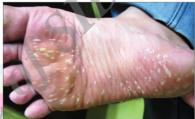
Figure 1: Pustular bacterid – Multiple, isolated 2–8 mm diameter sterile pustules on both palms

Many authors still question whether PB is a distinct disease. It is difficult to differentiate PB