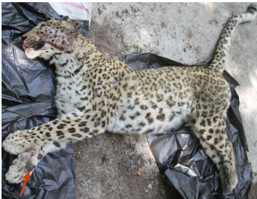
Figure 1. Grayish-white dermal nodule on the right toe in Persian leopard (arrow).

A seven-year-old female Persian leopard was dead because of accidents a road-kill in Golestan National Park, Iran, in May 2014. Following necropsy, skin mass on the sideline of the right toe was observed. The mass was dissected in necropsy. The resected mass sample was grayish-white in color and measured 2 \times 2 \times 1.5 cm, with necrosis at the cut surface (Figure 1). The sample was fixed in 10 % buffered formalin. Serial sections of the formalin-fixed, paraffin-embedded sample were produced and serial sections were cut, using a rotary microtome (Leitz, 1512, Germany) at 5 \mu\text{m} . The samples were stained by routine hematoxylin and eosin (HandE) and CD34 immunohistochemical staining.