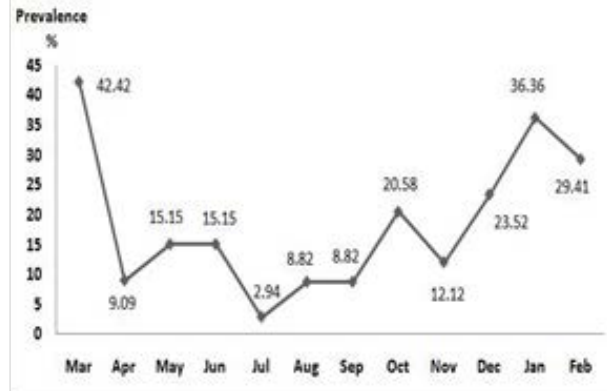
Fig 2. Monthly prevalence of Coenurus cerebralis in sheep.

In this survey the great majority of cysts were located in the cerebral hemisphere (5.15%), 54.63% in the left and