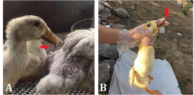
Fig.1. A and B) Cherry Valley ducks with typical signs of BADs (short beak with protruding and drooping tongue, red arrows) occurred in a duck farm in Dazu (Chongqing municipality), southwestern of China.

cavity. The results showed that the duck embryos died 84 to 144 hr after inoculation through sequential passage for three times. The infected allantoic fluids were collected, concentrated and purified by polyethylene glycol -6000 (Sangon Biotech) precipitation. Then, the purified samples were examined using a hemagglutination test according to Johnston et al. 6 Results indicated that the isolated pathogen could not agglutinate chicken red blood cells.