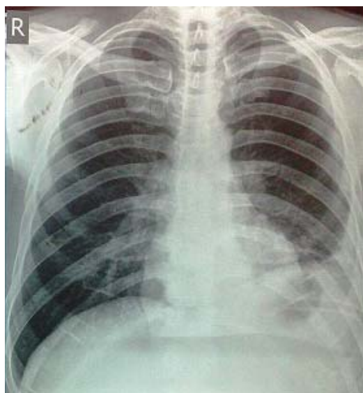
Fig. 1: Chest radiograph (X-ray) showing empyema in left lower lobe

received antibiotics according to the antibiogram. But he returned to our hospital with chest pain and the afore-mentioned signs and symptoms. TB skin test with PPD was negative. There were no laboratory findings indicating immunodeficiency or HIV. The HIV, HBV and HCV serologic tests were negative. The CBC showed anemia and leucocytosis. The ESR was elevated (82mm/hr Wintrobe's method) and he had hypoalbuminaemia. Both chest radiograph and high-resolution CT scan showed miliary infiltrates and diffused reticulonodular lung lesions (Figs. 1, 2).