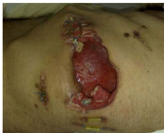
Fig. 3: Open window region in chest of patient

after diagnosis of TB, oral antituberculous treatment with four drugs was started (isoniazide: 300mg/daily, rifampin 600mg/daily, pirazinamide 1.5g/daily, ethambutol 1g/daily) for two months and then continued with two drugs (isoniazide: 300 mg/daily, Rifampin 600mg/daily) for four months. Finally, in order to prevent bone tuberculosis, we continued treatment with two drugs (isoniazide: 300mg/daily, rifampin 600mg/daily) for two more months. The patient was treated completely.