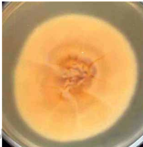
Figure 3. The Colony Reverse of M. Persicolor on Mycobiotic Agar