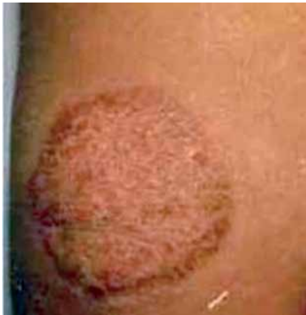
Figure 1. Lesion Caused by M. persicolor

on the reverse. The colonies were fluffy, flat, and gently folded in center (Figure 2 and Figure 3). Cultures on peptone agar developed a deeper rose-pink pigmentation. Microscopic examination revealed numerous micro and macroconidia. Microconidia appeared smooth, thin walled, spherical, borne en grappe, and en thyrses. Macroconidia often appeared spindle-shaped and thin walled with 5–8 cells and had echinulated walls. In addition, numerous spiral and coiled hyphae were observed (Figure 4). Urease test was also positive for this organism. Finally, the fungus was identified as M. persicolor .