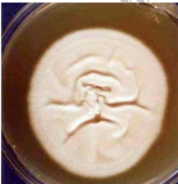
Figure 2. A M. persicolor Colony on Mycobiotic Agar after 2 Weeks of Incubation