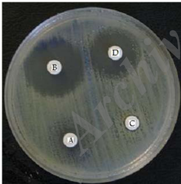
Figure 1. Extended spectrum \beta -Lactamases producing K. pneumoniae

(A = Cefotaxime B = Cefotaxime + Clavulanic acid) C = Ceftazidime D = Ceftazidime + Clavulanic acid) Clavulanic acid inhibited an extended spectrum of \beta -lactamases with the occurrence of a growth inhibition zone.