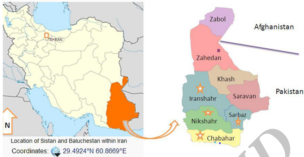
Figure 1. Map of the Study Area, Districts of Sistan and Baluchistan, Southeast of Iran