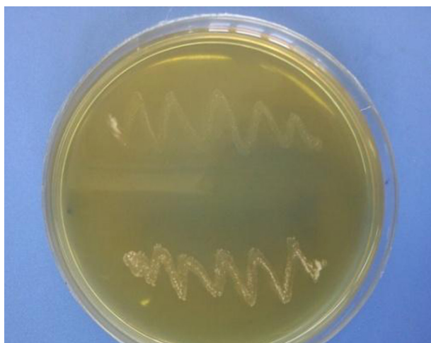
Figure 4. Bile Salt Hydrolysis in Sodium Taurocholate Medium by T And Y2 strains

In order to evaluate their beneficial effects in the host, probiotic bacteria must transit through the highly acidic stomach conditions in order to reach the intestine. Thus, resistance towards low pH is essential for the survival of the probiotics. As shown in Diagram 1, the most acid-tolerant strains were respectively isolated from yogurt, Tarhana and Ghareghoroot; however, no resistant strains were obtained from curd. The results indicated that the best option for isolation of potentially probiotic Lactobacilli is from yogurt which was obtained from Nazmabad and Moradabad villages.