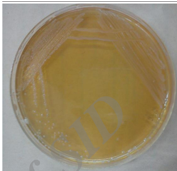
Figure 1. The Colony Isolated From Yogurt

Faecium strains isolated from traditional cheese of Argentina, 11 strains were able to grow in acidic conditions and bile salts (9).