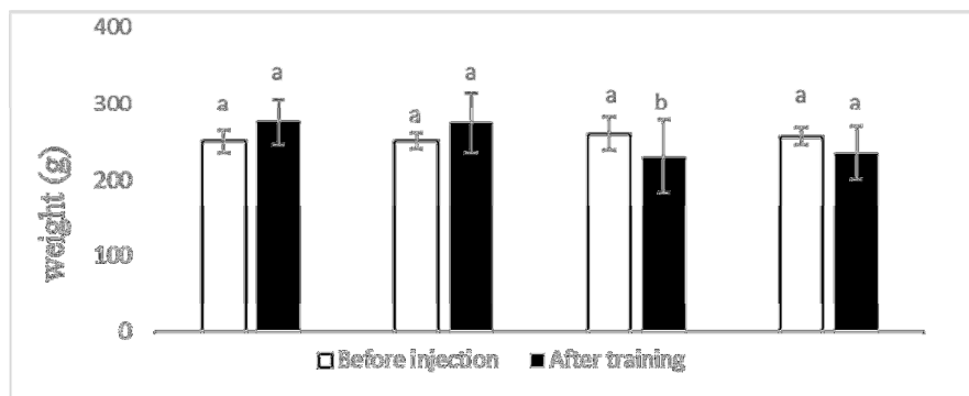
Figure 2. The difference of the weight in studied groups

rest of the groups, which is significantly different ( P -value: 0.007) (Figure 3).