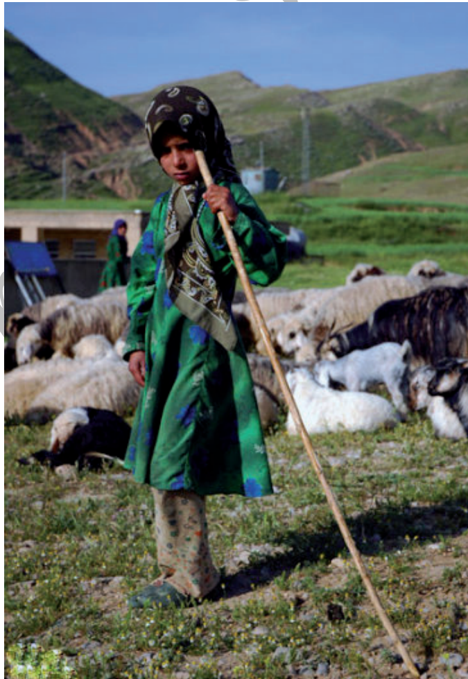
In our region, many boys and girls are shepherds and at risk of developing brucellosis and/or hydatid disease. (See pages 62 and 88)