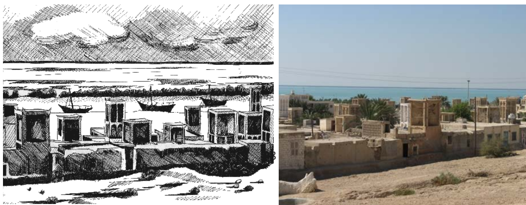
▲ Figure (3): the face of Laft port in the current situation and in the Qajar period, Source: (Lillian et al., 2010: 24).

ment, production continuity and prosperity crafts from time immemorial, Iran has played a role that is the existence of an economy based on agriculture and livestock. While the availability of raw materials for the manufacture of various types of vegetable and animal crafts, leisure and seasonal unemployment also causes generally can for crafts, provide good grounds for output and employment. Climatic conditions and climate variability and customs, customs and traditions in different regions and different crafts can create a variety of interesting and diverse images and designs to be effective. Iranian intrinsic interest in art, especially indigenous and traditional arts, which could pave the way for production or factor for demand works. Historically, each belonging to a specific period and show the impact of its cultural and artistic environment specific historical period and therefore today works with contemporary cultural treasures and the tablet is recorded as the actions and reactions of contemporary man, for future generations.