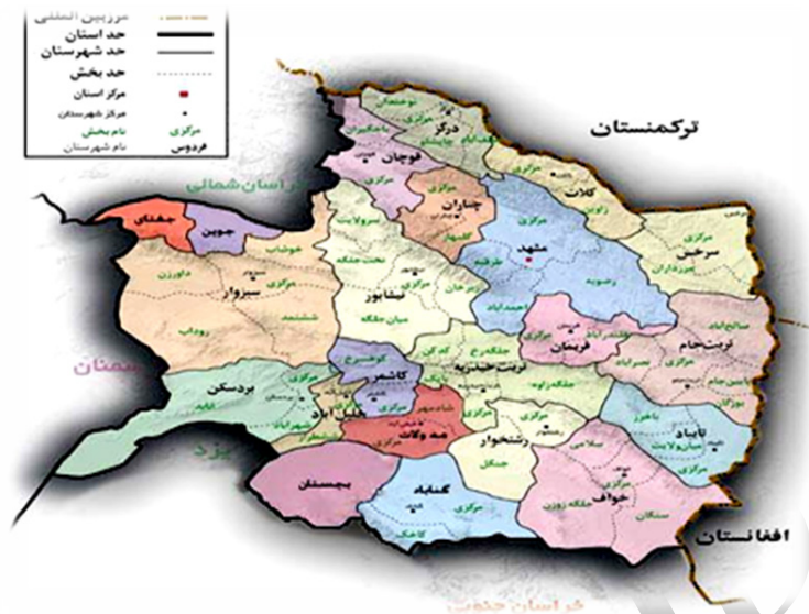
▲ Map 1. Neighborhood of Khorasan province with neighboring countries; (Source: www.khrorc.ir)

big cities. What can be seen today in Khorasan Razavi province is formation of settlements that have developed their own nationals. The autonomy is also given to the citizens to name the town after the name of the foreign citizens. These crime spots can be suitable centers for spying and formation of groups hostile to the regime, terrorist and subversive groups who are considered a great threat to security of the province and even of the country. Consequences of foreign nationals' presence in the province According to the statistics extracted from the legitimate provincial references and thorough survey with the related experts and elites, presence of foreign nationals has in general have the following consequences: