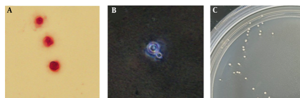
Figure 2. The microscopic morphology of Cryptococcus after different staining techniques was examined. A, after Gram staining, some circular yeast like fungi were found under the microscope; B, pink staining revealed a thick capsule surrounding the pathogen; C, white smooth colonies grow at 37°C after CSF inoculation.

Following the detection of positivity for serum capsule antigen, cerebrospinal fluid was collected from the lumbar region of the patient for examination. Gram staining revealed circular yeast-like fungi under the microscope (Figure 2A), while India ink staining exhibited thick capsules surrounding the fungal cells (Figure 2B). The cerebrospinal fluid was inoculated onto Sabouraud dextrose agar medium using a loop, and after 48 hours of incubation at 37°C, smooth white yeast-like colonies were observed. Additionally, the isolated colony was identified as Cryptococcus neoformans using matrix-assisted laser desorption/ionization time-of-flight mass spectrometry (MALDI-TOF MS). The Clinical and Laboratory Standards Institute (CLSI) has developed standardized methods for broth microdilution antifungal susceptibility testing of both yeasts and molds (10). We obtained the antibiotic sensitivity of this strain of C. neoformans using this method (Table 2).