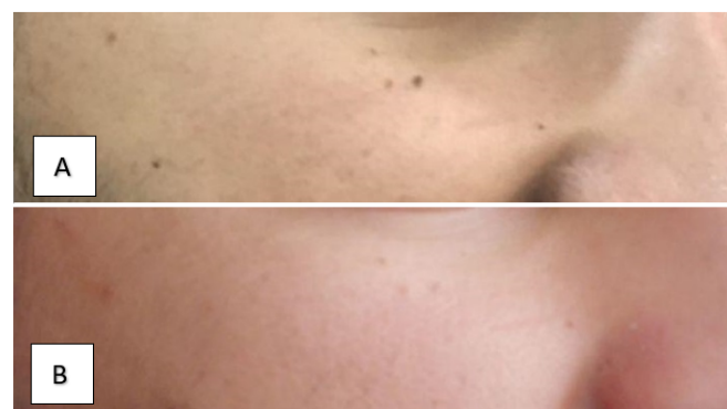
Figure 2. Before (A) and one month after the last therapeutic session (B)