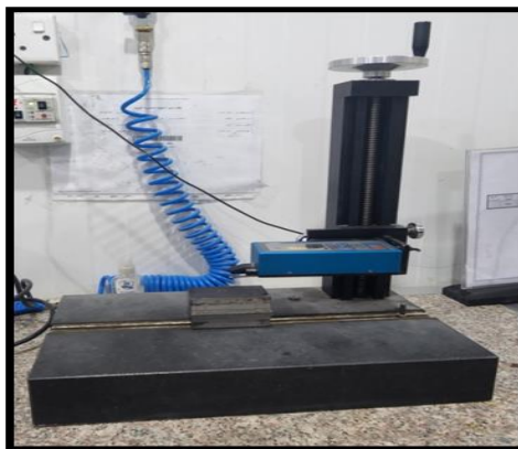
Figure 3: Digital roughness tester (profilometer)

stylus made contact with the sample in a way that did not cause any resistance as it moved in the opposite direction. The equipment was set up so that the stylus tip would scan a length of 11 mm. The surface roughness was measured in three random places on each specimen, and then the mean was found. This process is done for several times for each specimen.