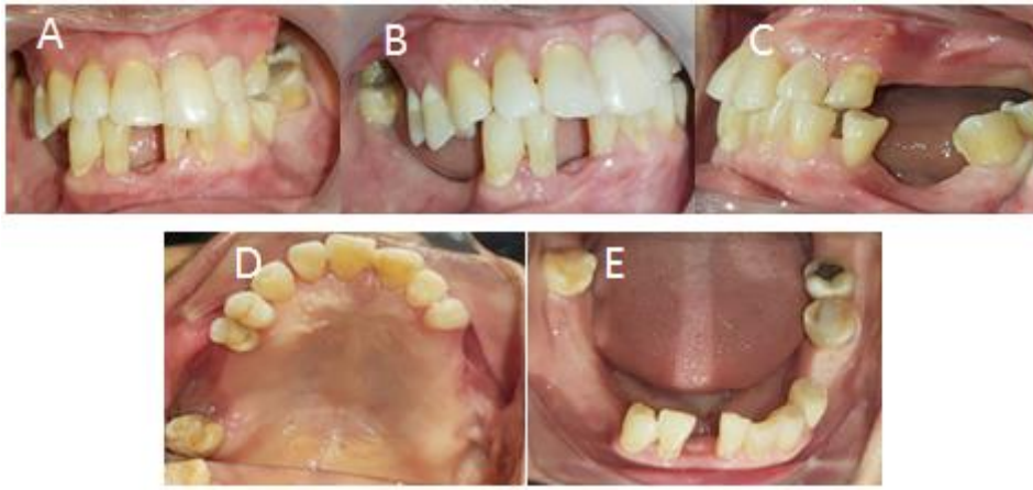
Figure 1: Intra Oral. In front (A), Right (B), Left (C), Maxilo occlusal (D), and Mandible occlusal (E)

Based on Figure 1 above, the oral hygiene seemed medium and there was a patch on the teeth number 11, 15, 14, 18, 21, 23, 37, 38, and 48; caries on teeth 11 and 21; abfraction on teeth 23 and 34; and lost teeth 16, 17, 24, 25, 26, 27, 28, 35, 36, 41, 44, 45, 46, and 47. On the radiographic examination ( Figure 2 ), there were radiopaque images of dental crowns and root canals 18, impressions of the root canal and dental fillings, radiopaque images of dental crowns on 15, 14, 22, 23, 37, 38, 48, the impression of dental fillings, radiolucent appearance of the crown of teeth 11, 21 impressions of dental caries, missing teeth 17, 16, 24, 25, 26, 27, 28, 36, 35, 44, 45, 46, and 47, and bone loss in region 1, 2, 3, and 4. When the patient comes to the clinic, informed consent has done. The printing of the study model with printing material irreversible hydrocolloid (alginate) and treatment in the teeth conservation field for teeth 11 and 21 along with providing the education and instruction for