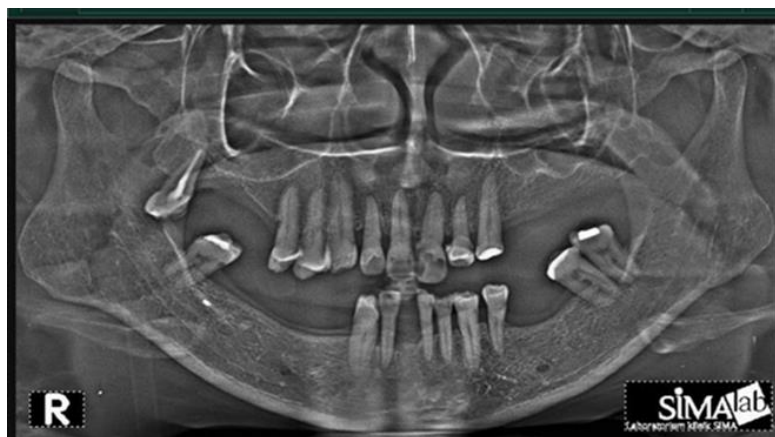
Figure 2: Patient's radiographic panoramic

treatment of oral cavity health has also done. Then, it is continued in making an individual printing spoon for physiology printing to obtain a job model and bite determination. Preparation was conducted in abutment teeth to make rest seat on teeth 13, 15, 18, 23, 34, 37, and 48. Functional printing of maxillary and mandibular with elastomer medium body is continued with elastomer light body material. Based on those job models, it is made metal frame with Akers clasp design on 15, 18, 34, and 37; RPY clasp on 23, rest addition on 13, c clasp modification on 43, and ring clasp on 48. After the metal frame was finished, a trial fit was carried out ( Figure 3 ), followed by making the bite rim, measuring the vertical dimensions, selecting the color of the teeth, and installing the model on the articulator. The next stage is the arrangement of the maxillary and mandibular teeth and trying them on the patient.