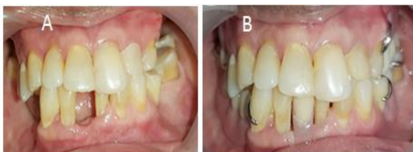
Figure 4: Before and after treatment

Subsequent laboratory work is making teeth contours acrylic packing, polishing, and inserting dentures on patients. During insertion, pay attention to the retention and stability of denture, esthetics, and patient comfort when using denture, phonetics, occlusion, and patient articulation. The patient was instructed to wear the denture for 24 hours, and the denture should not be used for eating and control the next day. The first and second control a week later, the patient had no complaints, the denture was used to chew food as usual, and the patient was delighted (Figure 4).