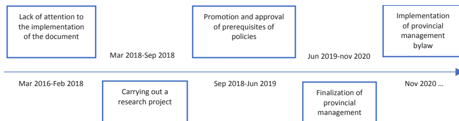
Figure 3. Time frames for the implementation of the bylaw of the provincial management of higher education

In the conducted research, policy implications were presented for the implementation of the SPHE document as a policy document in the country. Of course, researchers can present additional policy implications from various perspectives in future studies, building upon the narratives conducted in this research. The SPHE document is one of the most significant policy documents in the country’s higher education system after the Islamic revolution. Its articles 1 and 2, which emphasize regional management, are particularly important in this document. The implementation process of this policy can be divided into five time periods (Figure 3).