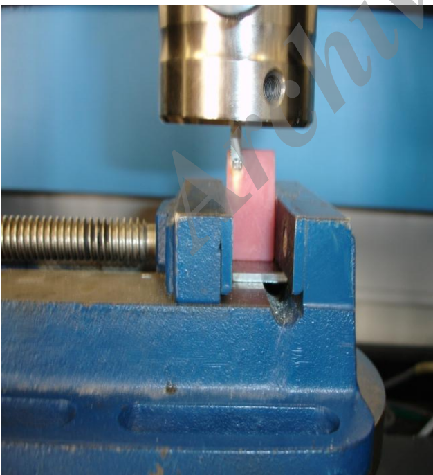
Figure 1. The sample placed in the universal testing machine