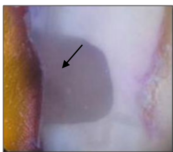
Figure1. Illustration of specimen with no leakage (Score0)

* The level of significance was considered at p < 0.05