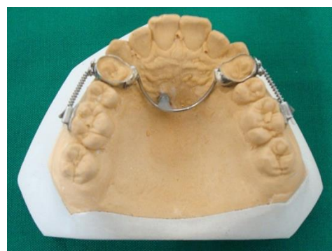
Figure1. Skeletal supported anchorage for molar distalization

The subjects were recalled at 4-week intervals and the coil springs were activated again and when the patient's occlusal relationship was converted to CI III up to 2 mm, distalization was terminated. Then the palatal arch was removed and replaced with Nance holding arch on molars to preserve the space. The mini-screw mobility was examined with zero (no movement) and one (presence of mobility) criteria after placement and at the end of distalization. Visual analogue scale was used to evaluate patient pain and discomfort one week after mini-screw placement and during its removal. Patients were asked to rate their expected pain experience on a 100-mm visual analog scale (VAS), where "0" represented no pain and "100" represented the worst pain imaginable. The following cut points on the pain VAS have been recommended: no pain (0–4 mm), mild pain (5–44 mm), moderate pain (45–74 mm), and severe pain (75–100 mm). [16] After the distalization period, a new cephalometric evaluation was carried out under the same conditions. The pre- and post-operative cephalograms were analyzed using the analysis techniques proposed by Nanda and Ghosh (Figure 2). [17] To determine the center of the tooth crown, the most prominent points in mesial and distal of the crown were connected by a line and the middle of this line was considered as the center of the crown (centroid). This line was used to evaluate linear-dental changes.