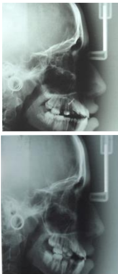
Figure 3. Upper: lateral cephalogram of pretreatment of 11 year old girl. Lower: posttreatment of the same patient and miniscrew placed in the palate. The upper molars were distalized

The figure 4 shows the superimposition of maxillary teeth before and after molar distalization. The amount of distalization in the first patient was 4 mm with 2 degrees of tipping, 4 mm with 5 degrees of tipping in the second patient, and 3.5 mm with 2 degrees of tipping in the third patient. The maxillary second molars were distalized 3 mm in the three patients. The long axis of this tooth exhibited distal tipping of 2 degrees in the first patient and 3 degrees in the second and third patients.