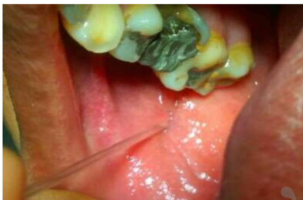
Figure1. Sampling saliva of parotid by laboratory micro hematocrit tube

special paste to prevent the outflow of saliva. This process is repeated for the gland of other side. Each person was assigned a number. The tube containing the saliva of each side was attached on the paper marked in terms of patient's number and their left and right side. The tubes containing saliva can be refrigerated until shipment to the laboratory. Age, sex, dominant side used during chewing and phone conversation, duration of daily calls and use of mobile phone were recorded. To increase the accuracy of recording the dominant side, a chewing gum was given to patient without informing them about the goal, they were asked to chew. All observations and oral examinations were recorded.