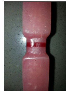
Figure 1. Acrylic specimens with 3mm wax in its narrowest part

Using soft liners: Each group were divided into two subgroups of 9 specimens for better investigation of each subgroup with one type of soft liner. To put and process the liners, a wax (Betadent-Macu-Iran) thickness equal to the thickness of the liner was placed in a 3-mm space (Figure1). Then, to prevent any disturbance in the flasking process, the excess wax was removed using scaple and no 15 blade.