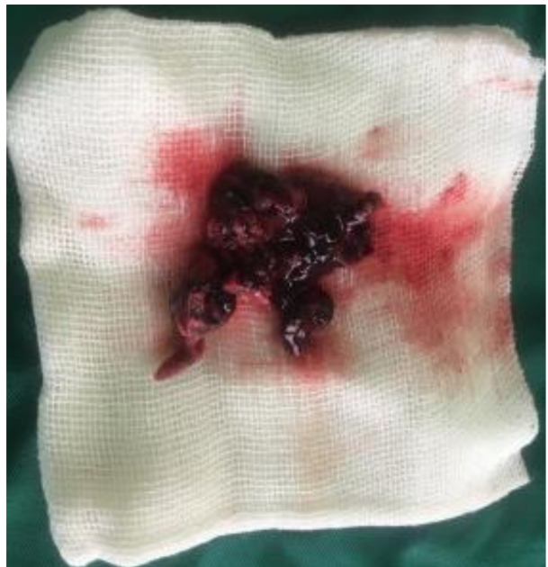
Figure 2: Pulmonary artery clot (left) and right ventricle clot (right) of case 2 extracted via thrombectomy.