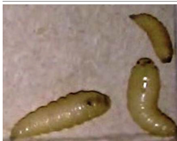
Figure 2. Removed Larvae