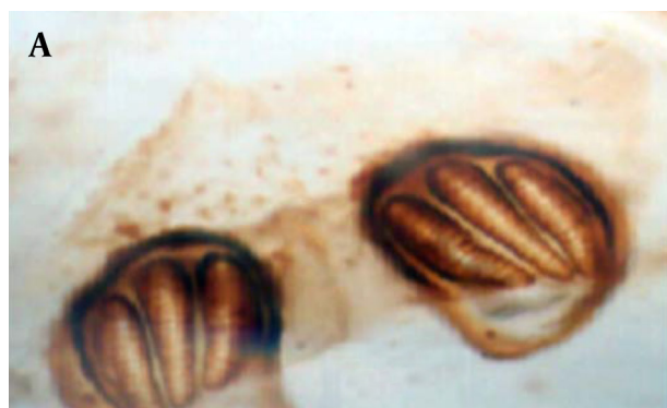
Figure 3. Morphology of Larva, Light Microscopy Picture