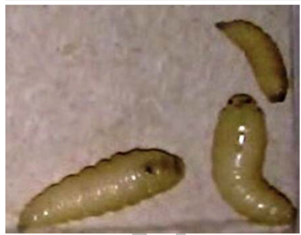
Figure 2. Removed Larvae