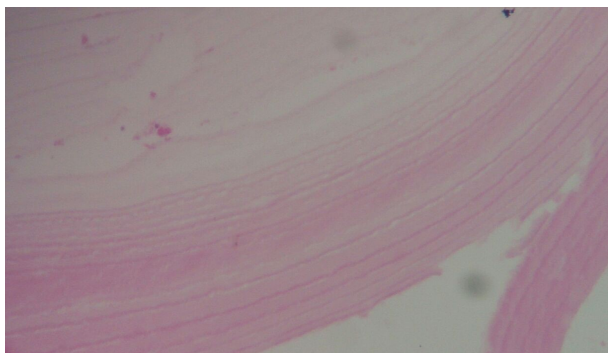
Figure 2. Laminated Membranes of Hydatid Cyst

Hydatid cyst can involve almost every organ of the body (2). Involvement of cervical cord with hydatid cyst is extremely rare. Description of the first case of echinococcosis affecting the spine was coined by Churrier in 1807 (5, 6). To the best of the author's knowledge, only three cases of intramedullary hydatid cyst have been reported in the current literature (7, 8). Senol et al. reported on a 55-year-old female patient, who had cervical intramedullary hydatid cyst, and there were also multiple cysts in her liver, spleen, and lungs, which were successfully removed by surgery yet her cervical intramedullary hydatid cyst was not operated due to high risk location, thus, the patient's follow up was done regularly (8).