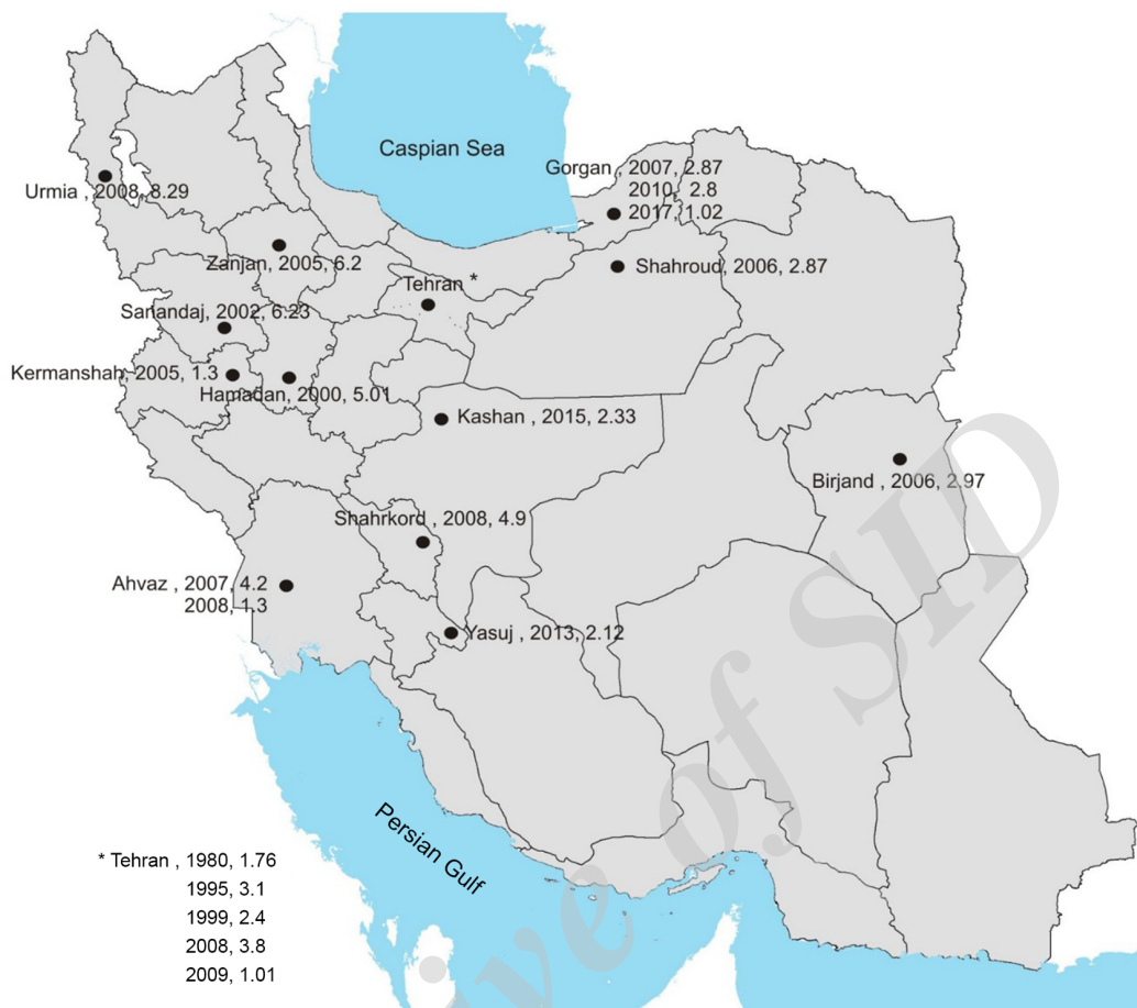
Figure 2. Incidence of neural tube defects