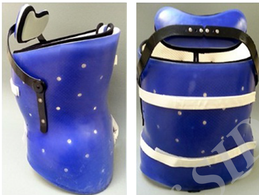
Figure 2. Standard anti-kyphosis TLSO brace used for treatment of SK

(5). Flexible malformations are usually managed by Ponte osteotomies and fixation from a single posterior approach, while for plain, immobile deformities, release from the anterior might be obligatory before the posterior step (5, 10, 47). Like other deformity operations, intra-operative nerve monitoring is suggested to attentive the surgeon while any spine handlings reason fluctuations in motor evoked potentials or somatosensory evoked potentials. Posterior kyphosis surgery contains shortening of the posterior column. Extreme stretch of the spinal cord or nerve roots might be a clue for alterations in these potentials, and the surgeon is able to reflect discharging some of the corrections since this occurs (10, 48).