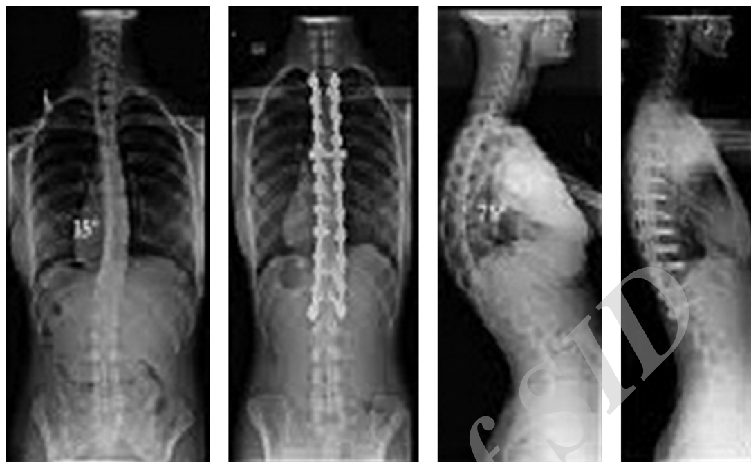
Figure 4. Comparative pre and post operation X-ray of the same patient with significant kyphosis correction