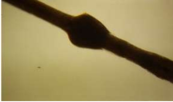
Fig.1- Thinning and sparseness of the hair and eyebrows