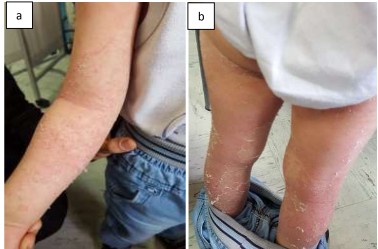
Fig.2- Ichthyosis linearis circumflexa (ILC) on antecubital (2a) and popliteal area (2b)