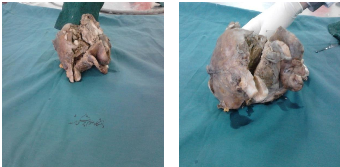
Figure 2. The macroscopic appearance of the tumor indicated a multilocular cystic tumor with solid components

On the first and eighth days, chemotherapy with gemcitabine (900 mg/m 2 ) was performed. Chemotherapy continued with docetaxel (100 mg/m 2 ) on the eighth day and every 21 days after the operation for six cycles. According to the one-year follow-up, the patient was disease-free. Unfortunately, no further information is at hand beyond this period.