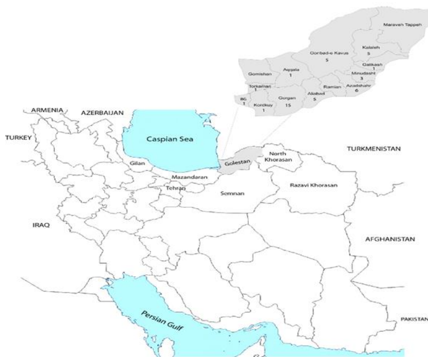
Fig 1. Map of Iran and the study area (Golestan province). The numbers indicate the patients in each county.

Clinical samples. Five ml of blood was obtained from 52 febrile patients residing in different counties of Golestan province (Fig. 1), from Jul. 2012 to Nov. 2013. The patients were referred to public health centers with fever and one other symptom, including headache and muscular pain. The samples were kept at 4°C, and then transferred to the Department of Parasitology, Pasteur Institute of Iran, within 4–7 days under a cold condition. The sera were separated after incubation at 4 °C for 24 h and used for different assays. Informed consent was obtained from all the adult participants, and the parents, or the children's legal guardians. The Ethical Committee of Research, Pasteur Institute of Iran reviewed and approved this study (Project No. 626).