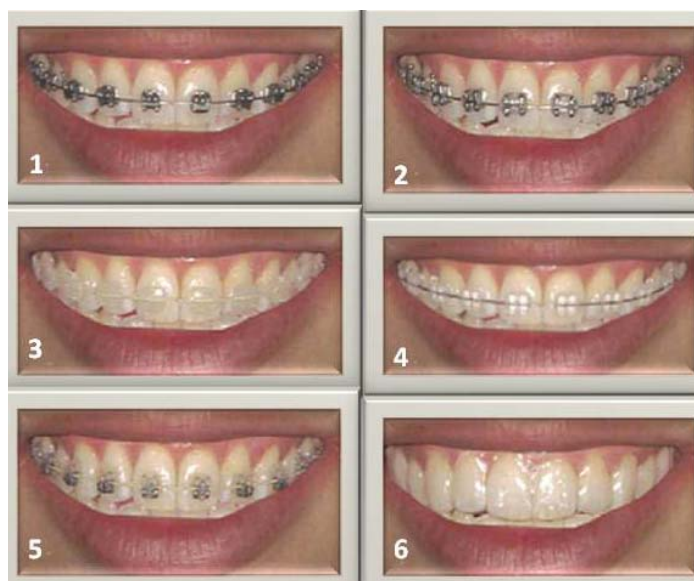
Figure 1: Standardized images of smile with metallic appliances (1,2) ceramic appliances(3,4),hybrid appliance(5) and lingual appliance (14)

Intra-examiner reliability of the VAS ratings was measured by intraclass correlation coefficient (ICC) analysis. Reliability of yes/no responses for acceptability was assessed by the kappa statistic. VAS rating for different kinds of brackets was analyzed by two ways ANOVA; also, VAS rating of brackets in each group was calculated by ANOVA. Post hoc testing was performed by Tukey-LSD and VAS value in males and females was analyzed by Regression. The level of significance was set at 0.05. The data were analyzed using SPSS software (version 19). Acceptability of each bracket in three groups was measured by Chi-square analysis. Acceptability of each bracket between males and females was calculated by Mann U Whitney analysis.