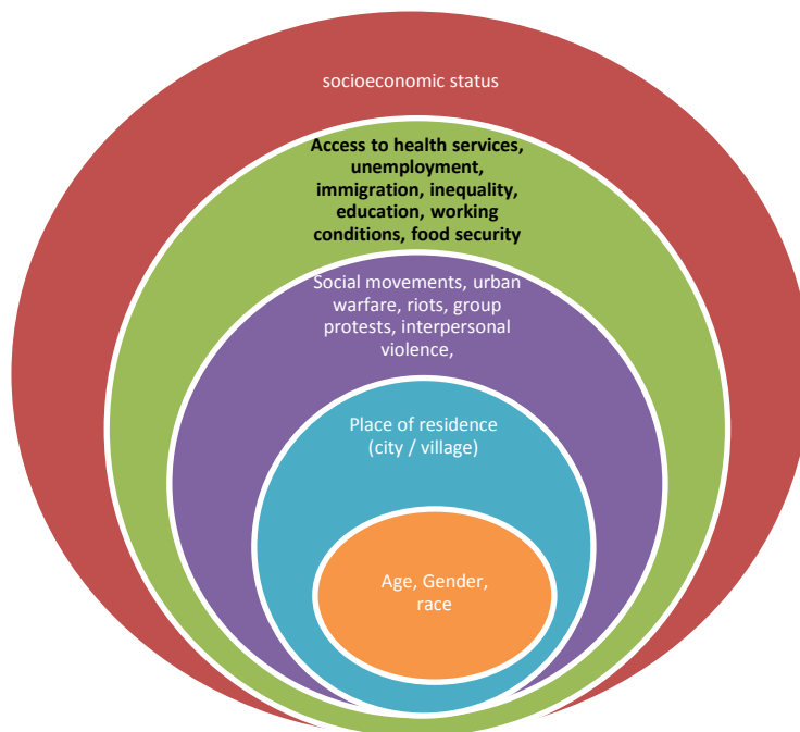
Figure 2, B. Division of social variables related to climate change based on impact levels