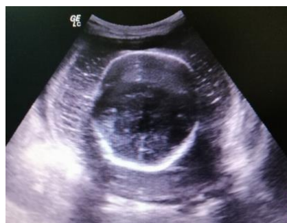
Figure 4. Obstetrical ultrasonography indicates fetal scalp oedema at 24 weeks POA