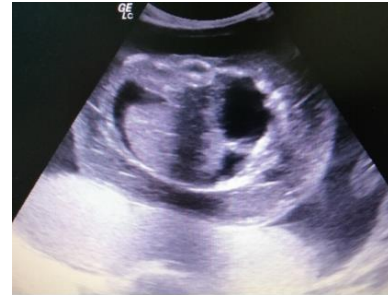
Figure 5. Obstetrical ultrasonography indicates fetal ascites at 24 weeks POA