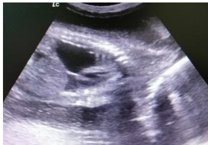
Figure 3. Obstetrical ultrasonography indicates fetal bilateral pleural effusion, left more than right side, where left massive pleural effusion pushing left lobe of lung and the heart to the right thoracic cavity, no pericardial effusion, both lungs hypoplasia at 24 weeks POA