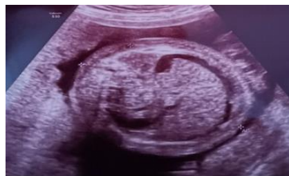
Figure 2. Obstetrical ultrasonography indicates fetal ascites and thick abdominal wall at 28 weeks POA