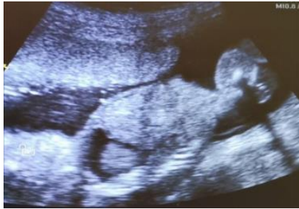
Figure 1. Obstetrical ultrasonography indicates bilateral pleural effusion at 18-week 3-day POA

she gets 150mg intramuscular Medroxyprogesterone every 3-month as family planning.