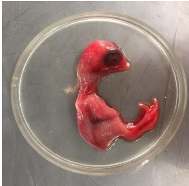
Fig. 1. Replication of IBDV in embryonated eggs caused severe hemorrhage and insufficient embryo development signs.

Similar to the ELISA result, the NI was significantly higher ( P < 0.05 ) in chickens immunized with inactivated IBDV with chitosan at 0.5 and 1% concentrations, compared to the other chicken groups (Fig. 3).