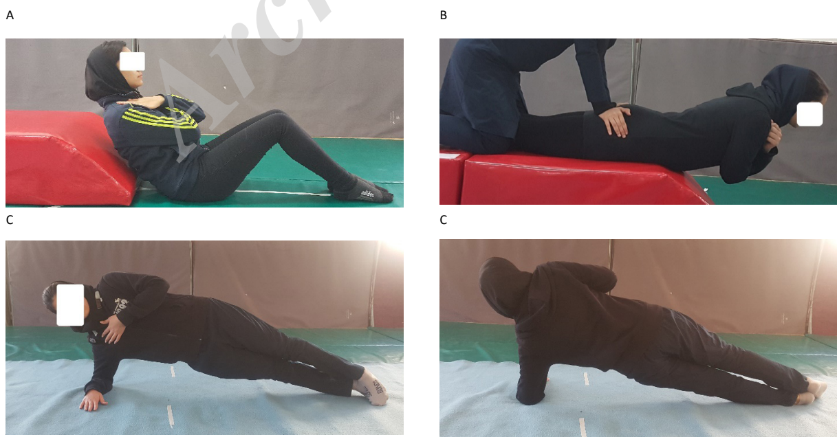
Figure 2. Core endurance test (A) Core endurance tests of trunk flexor, (B) trunk extensor, (C) and bilateral side bridge