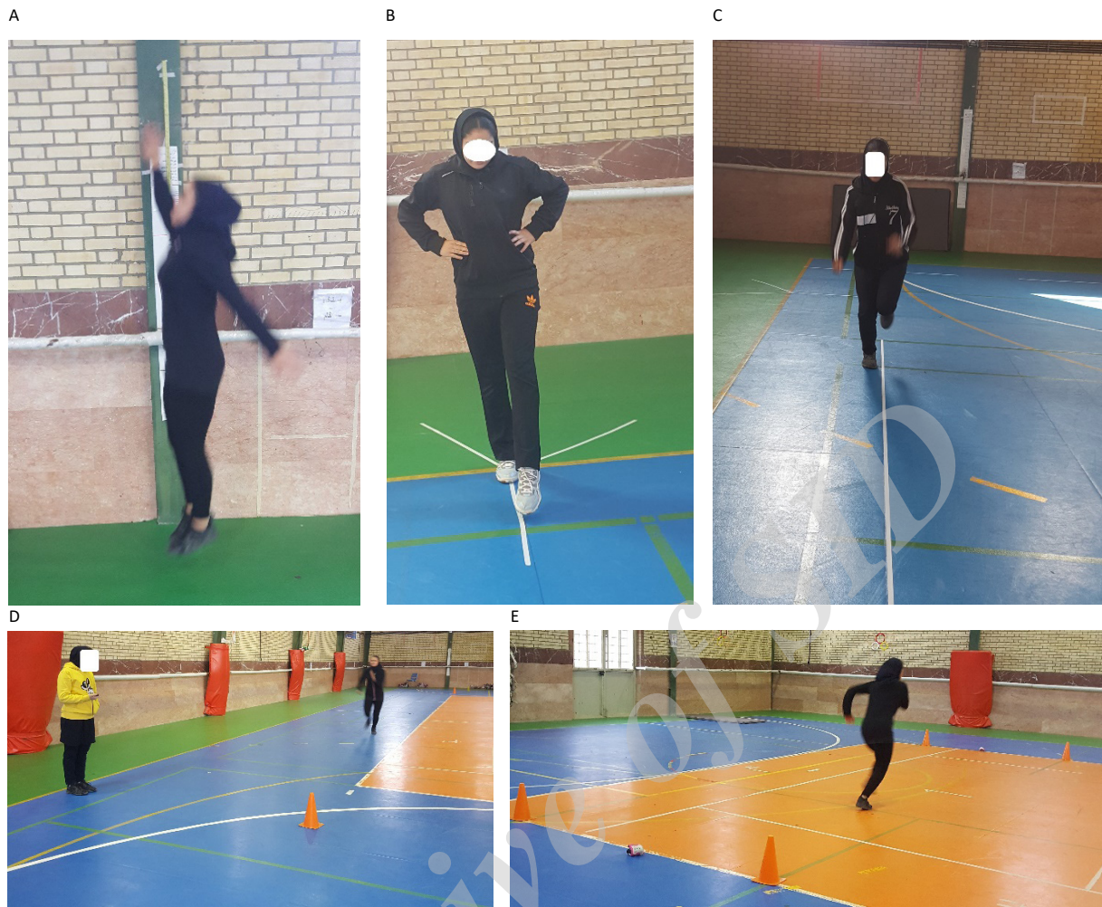
Figure 1. Balance and athletic performance test (A) Performance tests of vertical jump, (B) Y balance, (C) single-leg triple crossover hop test, (D) 20 m sprint, and (E) agility