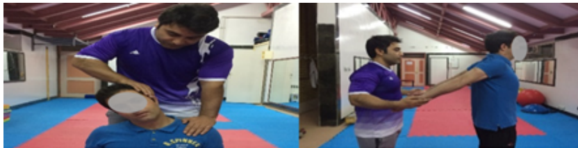
Exercise NO.17 (3 sets of passive stretch for 3 sec)