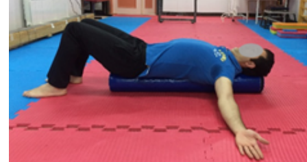
Exercise N0.12 (3 sets of passive stretch for 3 sec)