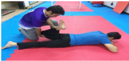
Exercise NO.15 (1 set of passive stretch for 3 sec)