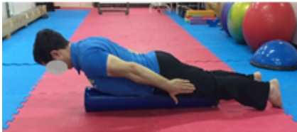
Exercise N0.3 (8×2)