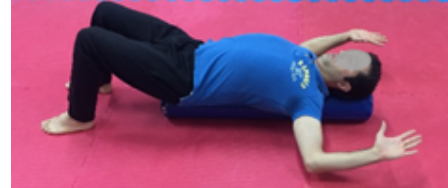
Exercise N0.8 (10×1)