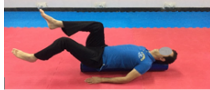
Exercise N0.6 (10×1)