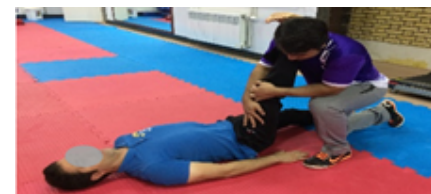
Exercise N0.14 (1 set of passive stretch for 3 sec)