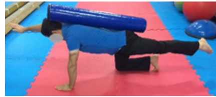
Exercise N0.2 (8×2)