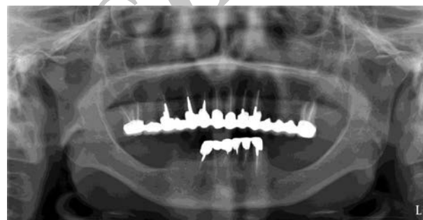
Figure 3. Squamous Cell Carcinoma Post-Operative Front View

involvement, and no angiolymphatic or perineural invasion. No complications appeared after the surgery, and neither the alveolar nor the mental nerve were impaired. The patient did not present feeding or phonation problems. The patient was declared disease-free on 21 October 2014.