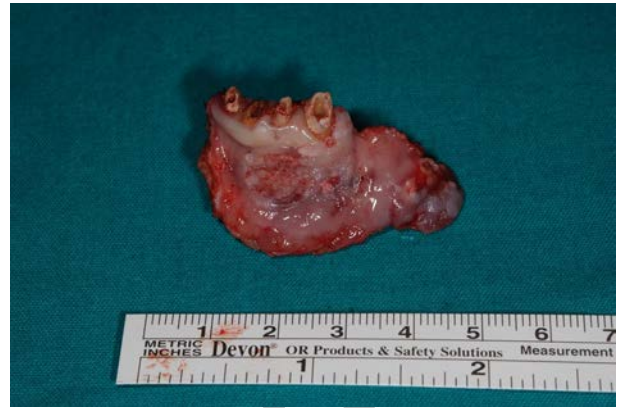
Figure 2. Pretreatment Panoramic View

this approach was enabled by the use of the piezosurgery device.