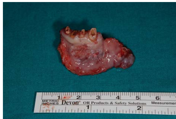
Figure 2. Pretreatment Panoramic View

Direct closure was achieved by direct suturing of the flap. Both intraoperative and then definitive histological examination of the removed section revealed a squamous cell carcinoma G1, T1, N0 with negative margins, no bone