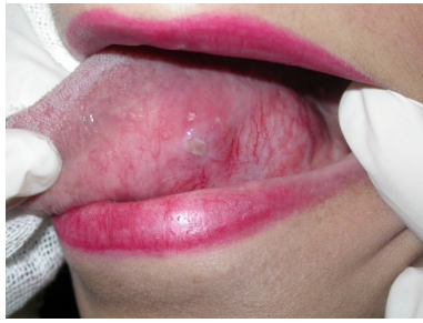
Figure 1. A Small Aphthous Like Ulcer in Left Lateral Border of Tongue.

the specimens revealed a vascular tumor with lobular architecture. Connective tissue showed numerous capillary-sized vessels lined by plump endothelial cells extending between skeletal muscles (Figures 2 and 3). Some of the vessels were filled with RBCs. The lesion was covered by parakeratinized stratified squamous epithelium with acanthosis. Therefore, given the clinical and histological results, the patient was diagnosed with capillary hemangioma. This patient did not attend for follow-up examinations after the confirmation of the diagnosis.