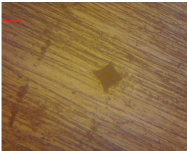
Figure 2. The Effect of the Indenter on the Enamel.