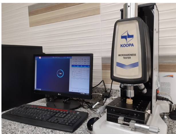
Figure 3. Vickers Microhardness Tester (KOOPA MH4, Mazandaran, Iran).

The mean SMH values were compared between groups using one-way ANOVA and Tukey post hoc test. The level of significance was set at 0.05.