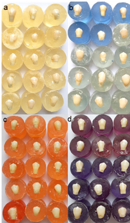
Figure 1. Four Experimental Groups of Teeth Mounted on Acrylic Plates with Different Colors (a: Control Group, b: Demineralized Enamel Group, c: Sodium Fluoride Varnish 5% Group, and d: Silver Diamine Fluoride 38% Group).

Data were saved on an Excel spreadsheet, and statistics were calculated using the Statistical Package for the Social Sciences (SPSS) software version 21.0 (SPSS Inc., Chicago, IL, USA). Kolmogorov-Smirnov test showed that surface microhardness of teeth in the four groups had a normal distribution.