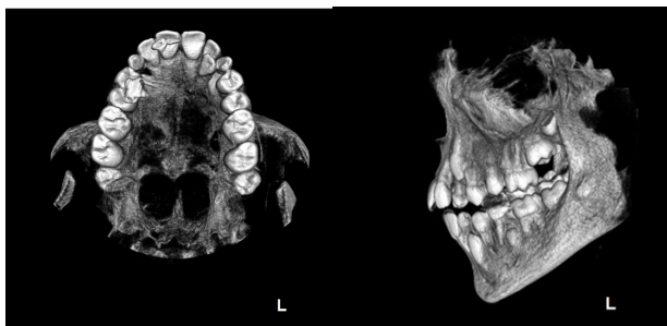
Figure 4. CBCT 3D View.