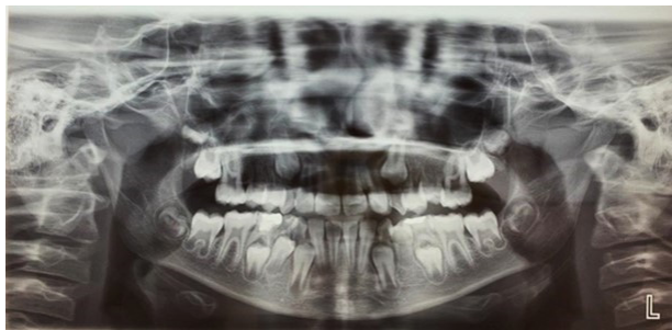
Figure 3. Panoramic View.