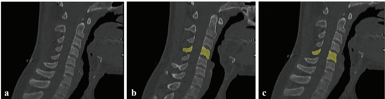
Figure 1. (a) The CT-Data Set of the spine, (b) C-4 is segmented from other cervical vertebral bodies, (c) C-5 is segmented.

models are registered by 2D-To-3D registration technique on fluoroscopic frames as it is shown in Figure 2 (a,b). Three-dimensional (3D) joint kinematics analysis of the spine could supply information such as location and orientation of instantaneous axis of movement. Indeed, previous studies investigating cervical kinematics mainly used 2D analysis for describing joint displacement and motion axis location 6,7 .