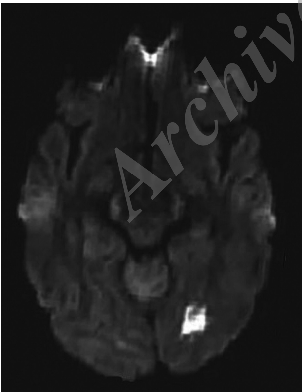
Figure 1. A hypersignal lesion is evident in the left occipital lobe which is the infarction.

Since the non-infectious causes of CVST such as diabetes, anti-thrombin III deficiency as well as C and S proteins deficiency were evaluated in this patient and