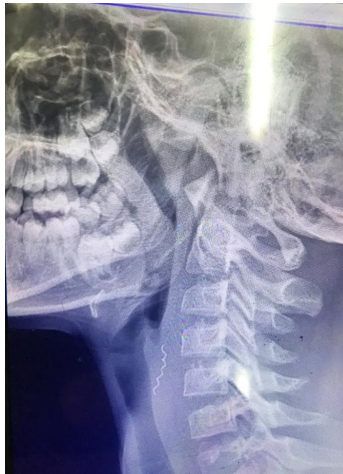
Figure 1. Lateral cervical x-ray shows a piece steel wool (arrow) in the hypopharynx region.