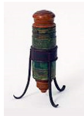
Figure 3. Galilei’s Compound Microscope (2).

to produce a sharp image), which was a breakthrough in microscope history that was based on trial and error till 1860.