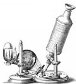
Figure 4. One of Robert Hooke's Observatory Devices (3).