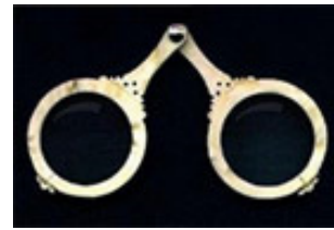
Figure 1. Salvino D’Armata’s Magnifying Eyepiece (1).