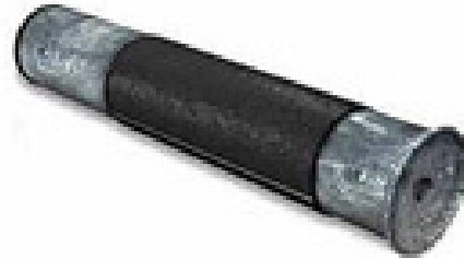
Figure 2. Zechariah and His Father, Hans’s First Compound Microscope (1).