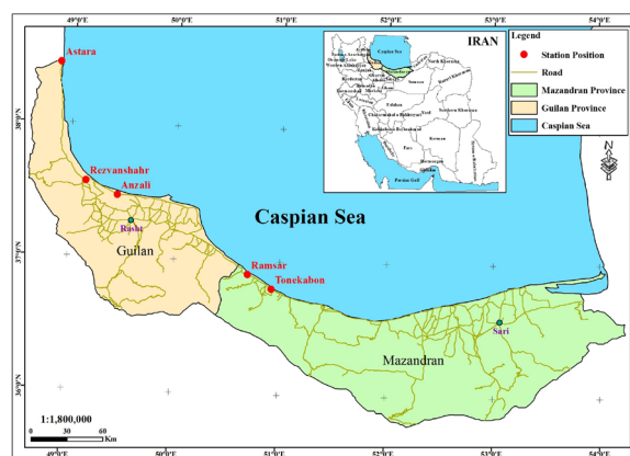
Figure 1. Location of the studied stations

Thirty fish samples were collected from five fishery sta-