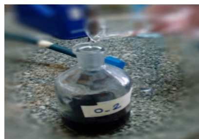
Figure 3. Transfer of water samples into the growth medium