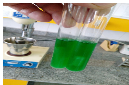
Figure 4. Inoculation in BGLB Growth medium.