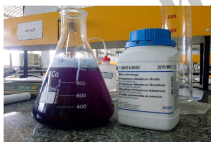
Figure 1. Preparation of P-A growth medium.

According to the results of the P-A tests and in compliance with Iranian National Standard No. 3759, in relation to the bacteriological characteristics of packaged drinking water, the optimum level and the maximum permissible total coliform in packaged water was set at zero in 100 mL, and according to the WHO guidelines, the microbial quality of packaged drinking water supplied in Sari was within the standard range. However, the results of the tests led to the absence of coliform in bottled water, but microorganisms are always capable of growing on suitable growth sites and bottled water can increase the number of microorganisms that can survive. Inappropriate disinfection, improper storage conditions, the problem of the bottled water production process in the factory, and the presence of microbial contamination in the source of bottled water, may cause undesirable changes in color and taste, and in the more severe cases, an increase in the burden of